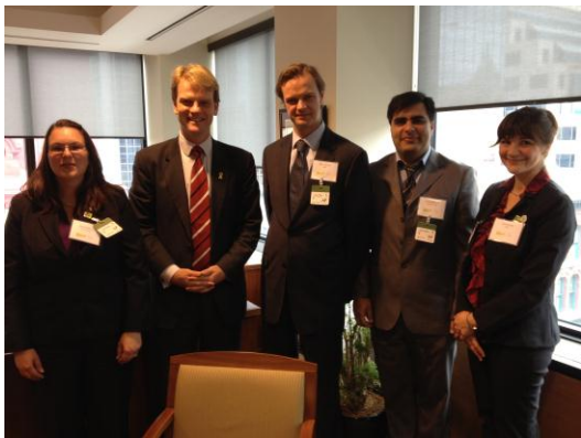
Members of WiN and NAYGN with MP Chris Alexander (2nd from left)

The second NU Energy on the Hill Day, Sept 30-Oct 1, was a great opportunity for members of Canada's nuclear industry to get together and learn from each other's experiences in different areas of the industry. More than that, it was a great chance for us to share our